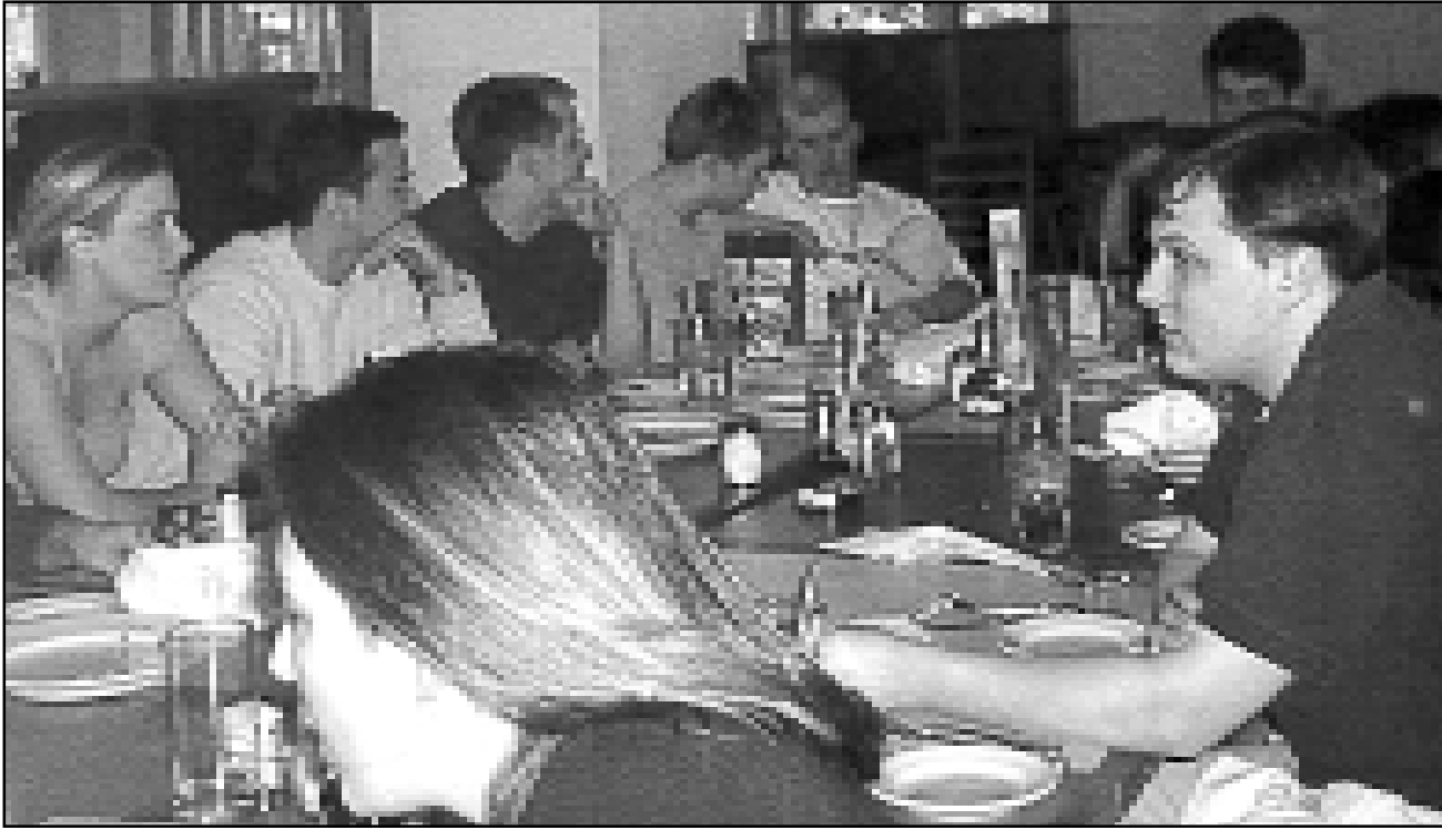
Juniors get together for a pizza party to celebrate Junior Date