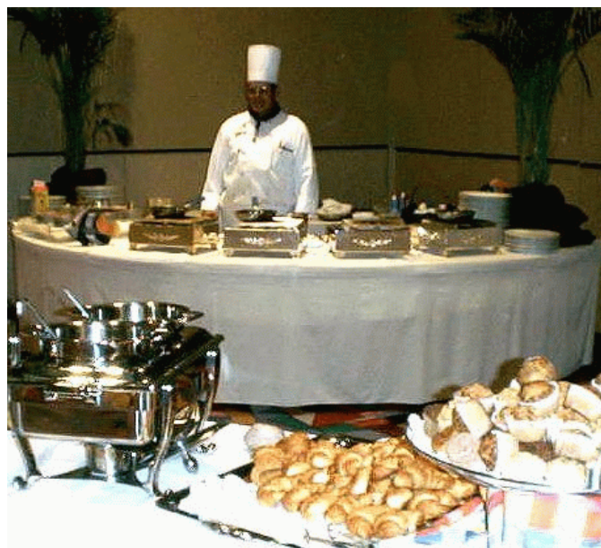
Puttin' on the Ritz