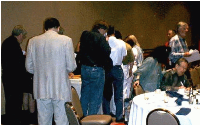
"If you can spend $1,200 on that pair, I'm going shopping!"