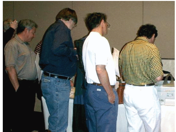
"Is this the Lotto line?"