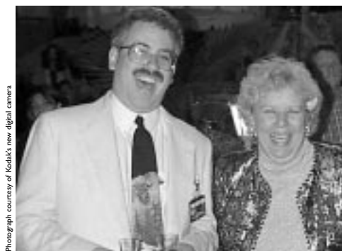
"He's tipping USA!"

two spades at the end for one down; -50 and 4 IMPs to USA1, ahead 43-32.