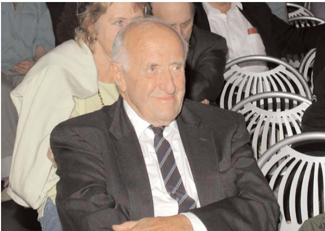
Marc Hodler follows the action on VuGraph

As we move into the second half of the Round Robin the Bermuda Bowl race is headed by USA II and Poland . In the Venice Cup France are setting the pace from England . In the Seniors Bowl France are now the only unbeaten team in all three competitions but they are only just ahead of Italy .