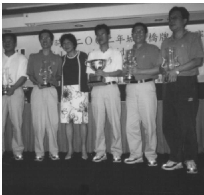
SAIC (Shanghai) 2002 HK Inter-Cities Champions