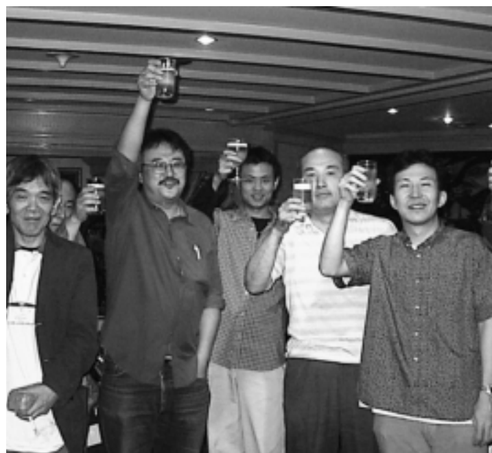
The Japan Open Team