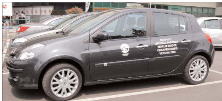
A Clio, one of the cars provided by Renault, a tournament sponsor