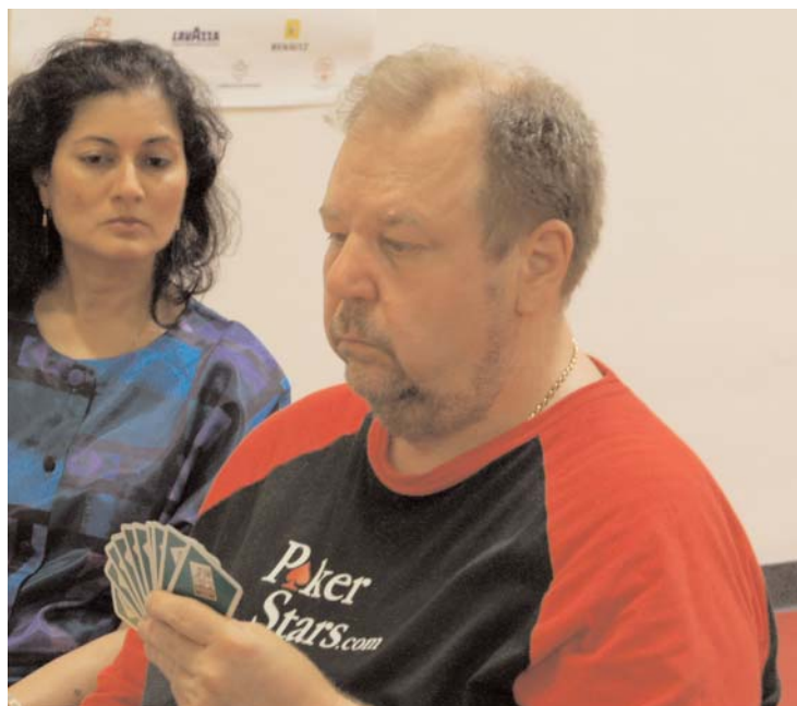
Jeff Meckstroth, USA